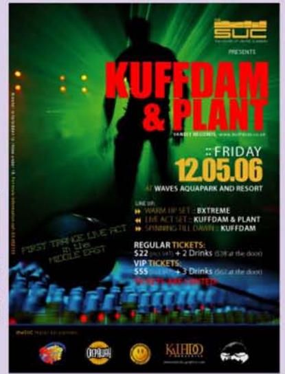
Flyer & Poster