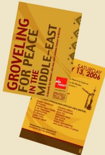
Fold Out Flyer