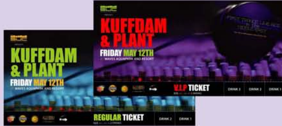
Event Tickets: Regular & VIP