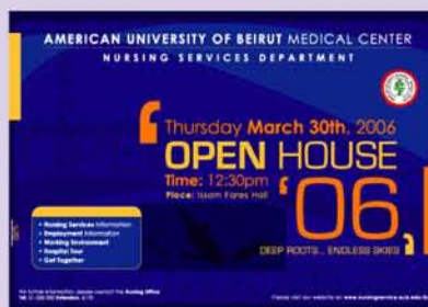
Open House Poster